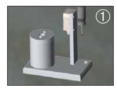
Move the probe along the sensor to trigger the cycle.