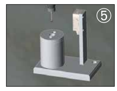
The cleaning cycle is completed when the probe rests above the cleaning unit.