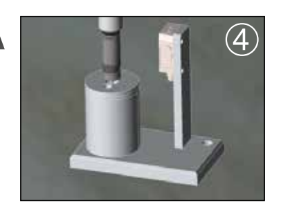
For about 20 seconds the probe moves up and down through the cleaning unit several times. Compressed air cleans the stylus.