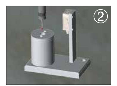
The probe automatically moves over the cleaning device